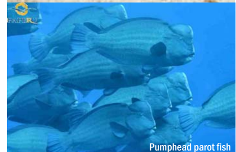
Humphead parrot fish