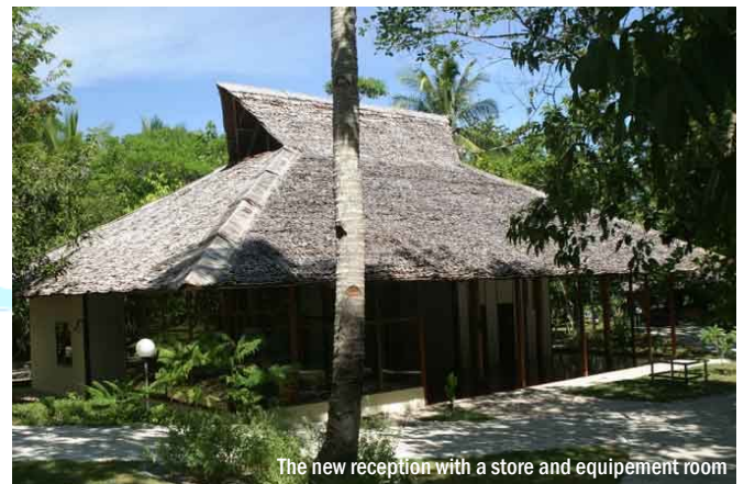
The new reception with a store and equipment room

We are using the time of the coming rainy season, when our resort is