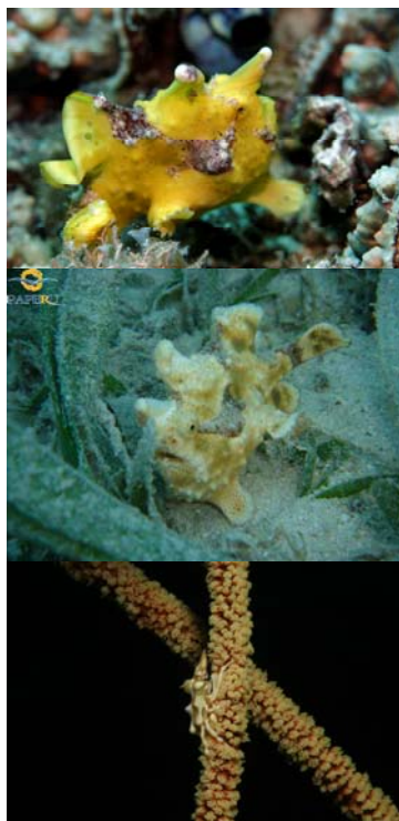
Froggisch and Mickeymousekrab